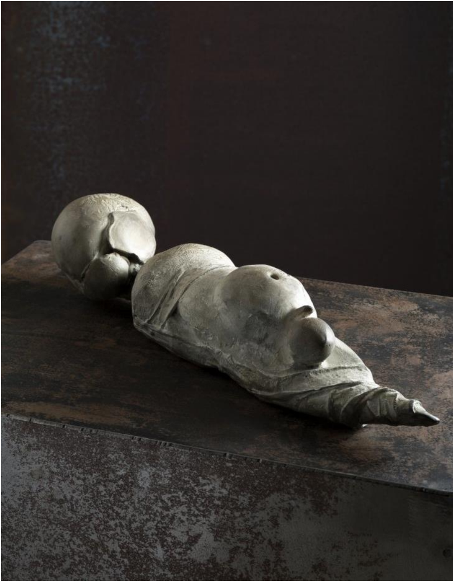
Infant I , 2011