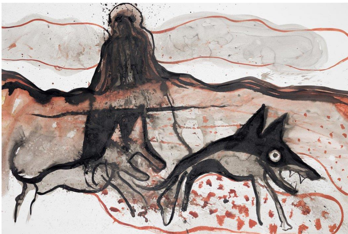
Lost 6 , 2015 Indian ink and bistre on paper 110 x 75 cm