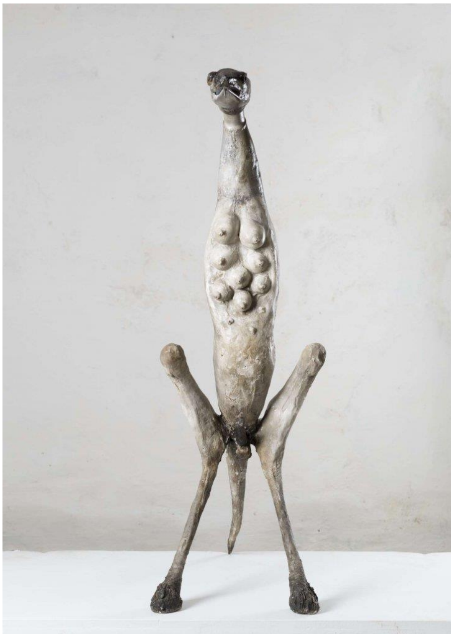
Archangel , 2015 Gypsum plaster, iron 113 x 37 x 82 cm