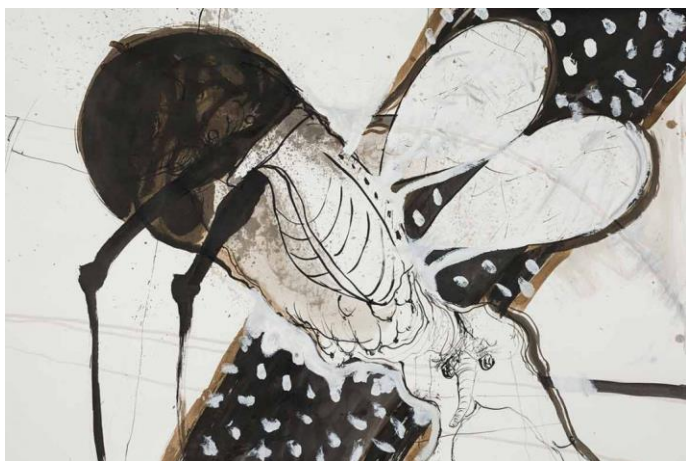
Archangel 3 , 2019 Indian ink & bister on paper 75 x 110 cm