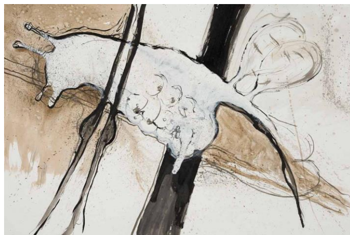
Archangel 4 , 2019 Indian ink & bister on paper 75 x 110 cm